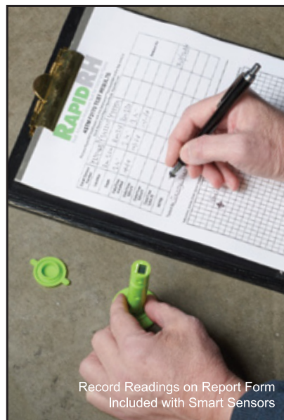
Record Readings on Report Form Included with Smart Sensors

Extra copies of the report form and an ASTM F2170 checklist can be downloaded at www.rapidrh.com . You can also visit www.rhspec.com to find links to various finished flooring manufacturers' installation guides and their RH thresholds. For any additional questions related to what RH levels are appropriate, please contact the manufacturer of the product to be applied to the concrete slab.